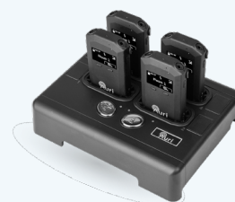
Auri™ D4 Docking Station 4