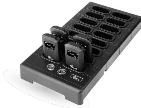
Auri™ D16 Docking Station 16