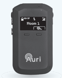
Auri™ RX1 Receiver