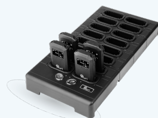
Auri™ D16 Docking Station 16