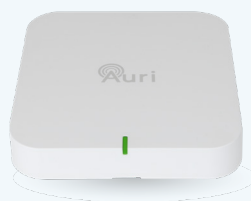
Auri™ TX2N, TX2N-D (Dante) Transmitter