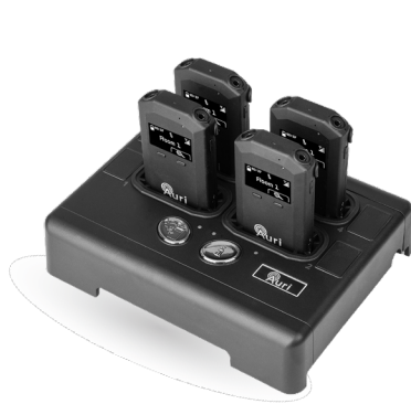
Auri™ D4 Docking Station 4

Receiver Management and Configuration Storage: Docking stations can store a complete receiver configuration, including settings, broadcast library, and the latest firmware update. Choose whether receivers should be automatically updated when docked or manually updated at the push of a button.